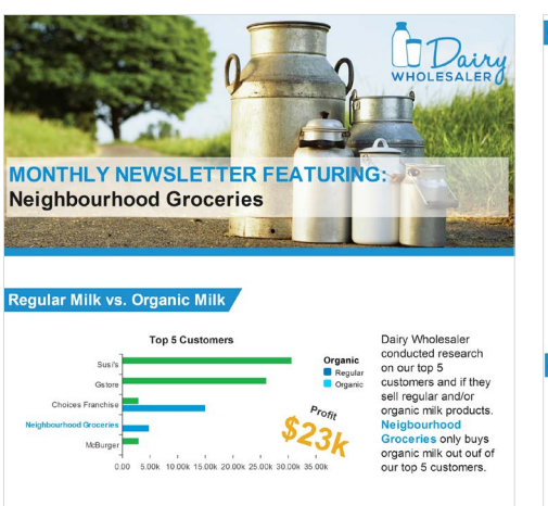
Figure 2: Infographic for SAP Lumira®

No need to add to your IT department workload